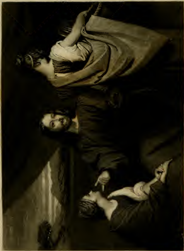
The Home at Bethlehem